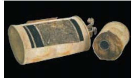
The glass fiber roving in these silencers, filled with the Owens Corning Silentex noise control system, essentially is unaffected after six years and 270,000 km of service.

For more than 5 decades, Owens Corning has been a solution provider to the Automotive Industry and their suppliers. From the introduction of the fiberglass reinforced Corvette in 1953 to the latest Owens Corning materials and parts for acoustic and reinforcement applications, Owens Corning has grown to become the largest supplier of fiberglass based materials to the global automotive industry.