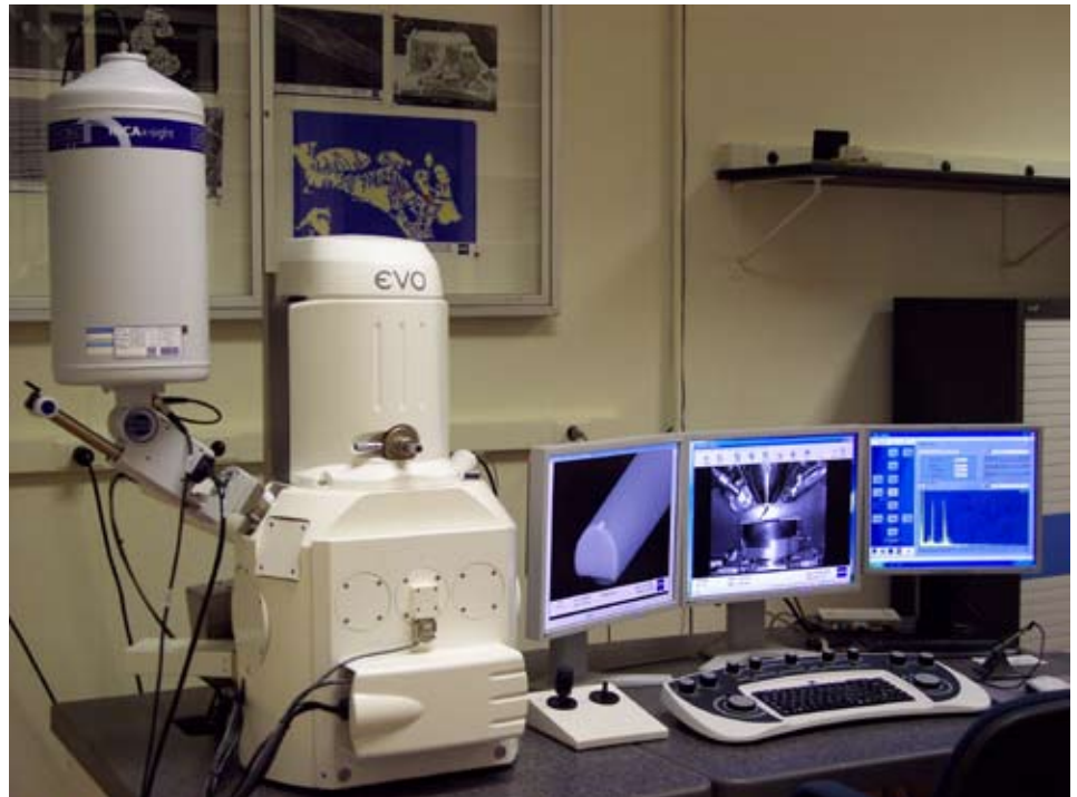
Analytical Scanning Electron Microscope (SEM)

The Owens Corning total system approach to silencers in all types of applications is exactly that. A total system approach that offers you everything you need for a unique noise control system. It comprises the patented Advantex glass fiber, filling machines, patented texturizing nozzles, a variety of products to help you introduce Silentex materials into your muffler, guidance in muffler design from both a filling standpoint as well as acoustic and thermal performance, start-of-the-art analytical facilities and equipment, fundamental research indicating the optimum ways in which Silentex materials can be utilized in silencers.